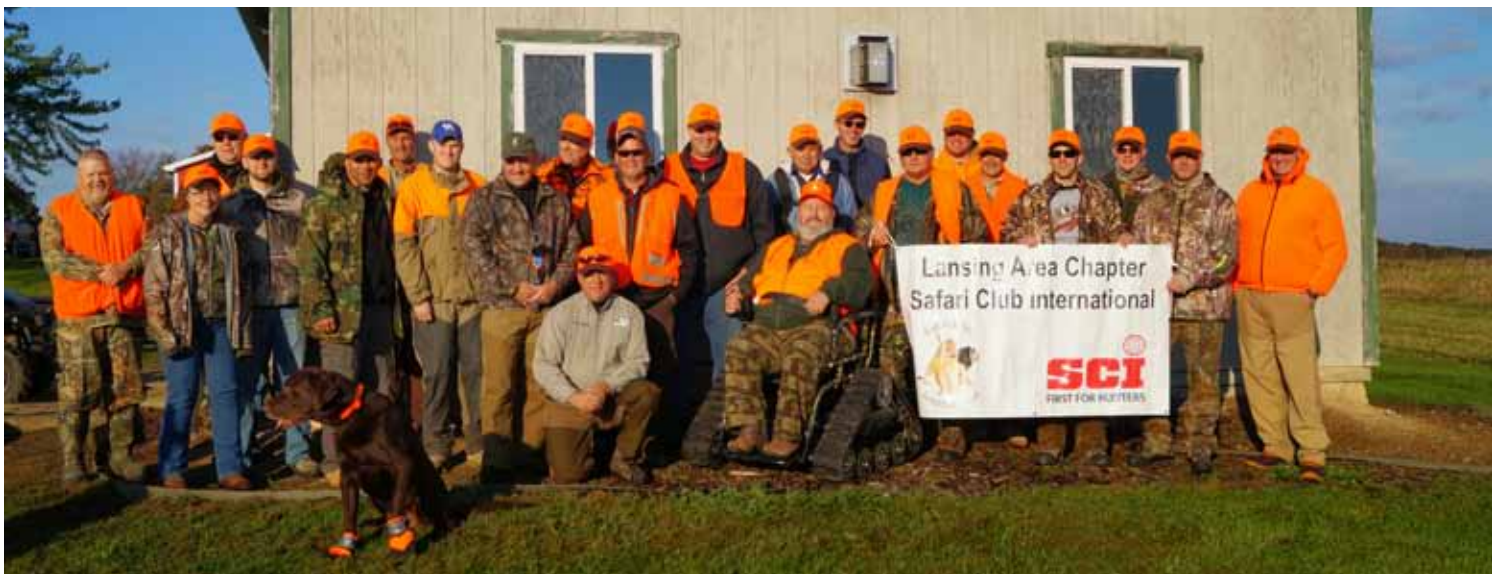
Bear Creek Hunt Club