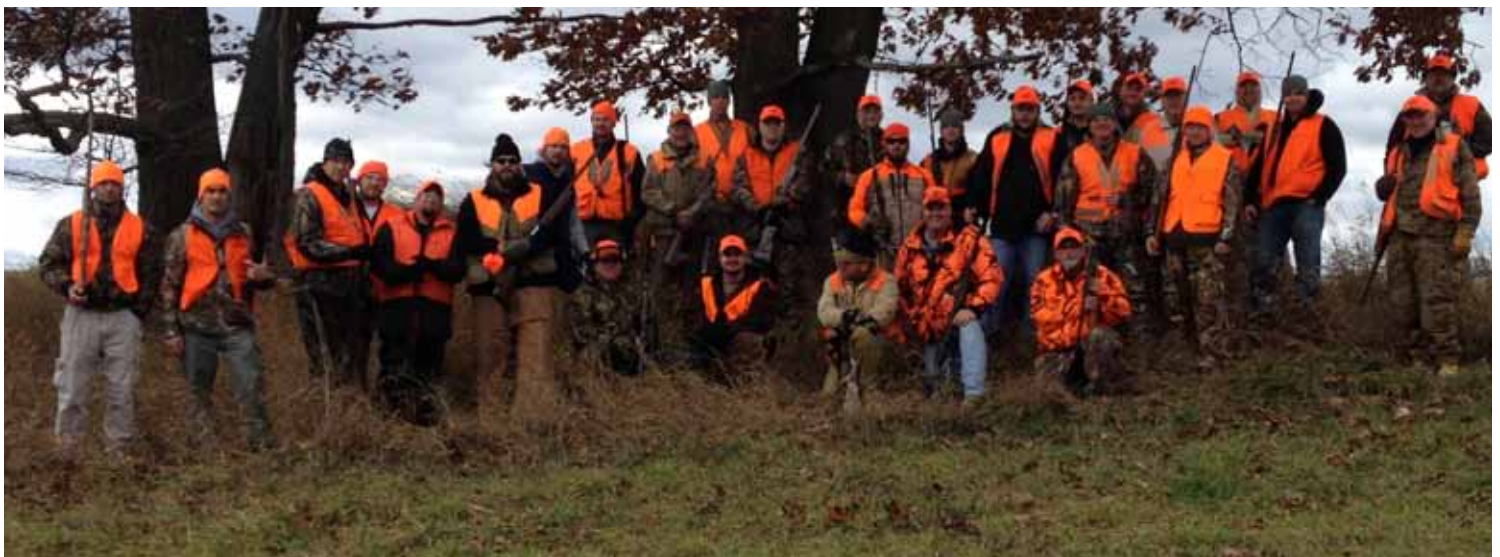
Omega Farms Hunt Club